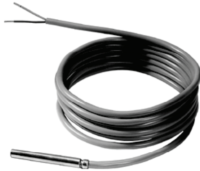
QAZ21.. and QAZ36..